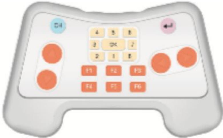
Remote Controller (1)